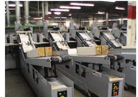
SuperFeeder-XA is available in a version that has an adjustable angle on the load conveyor to best suit the products being run.