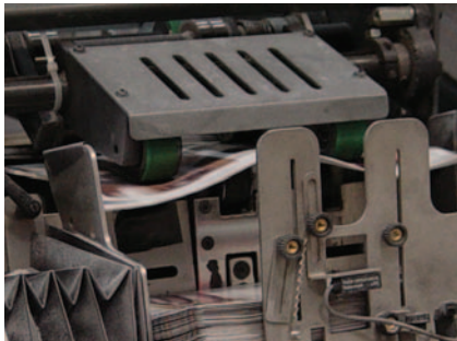
Signatures are corrugated to ensure even light-weight stock is well jogged in the pocket.